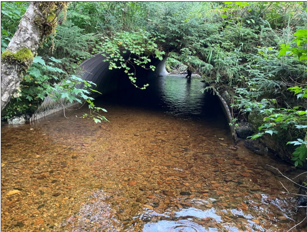
Figure 3.—Culvert at waypoint 1257.