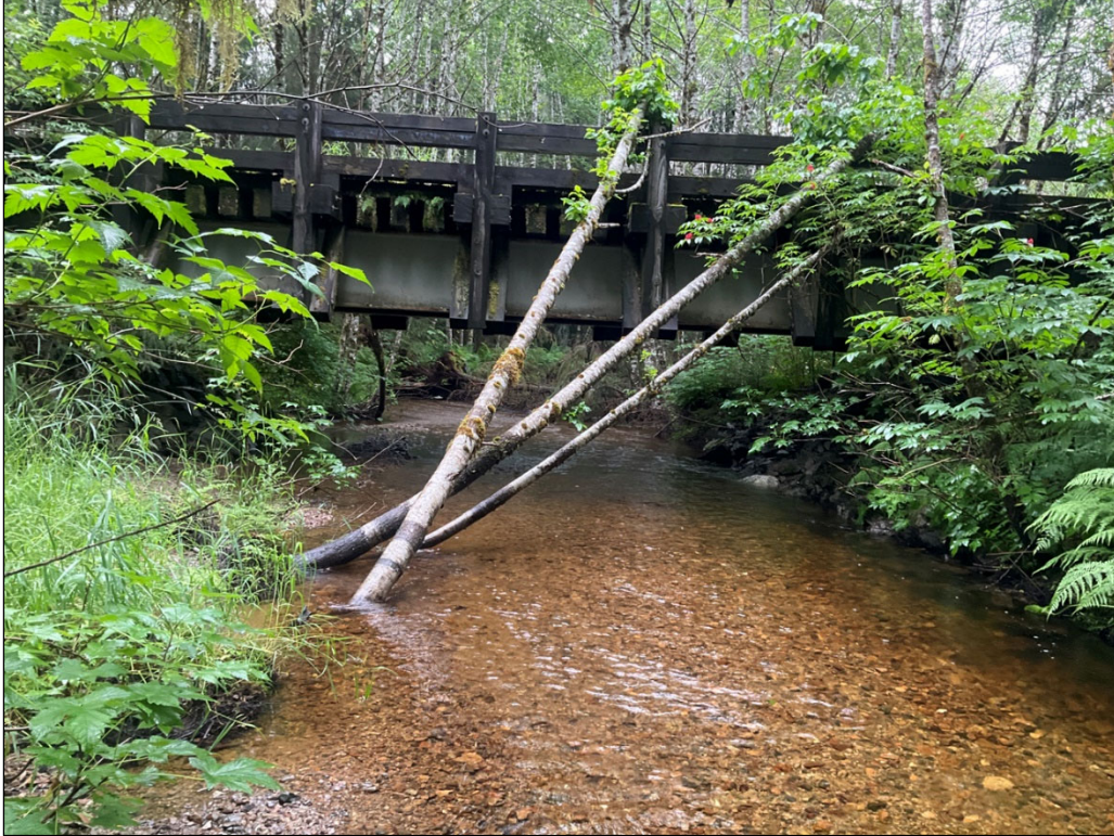
Figure 2.—Bridge at waypoint 1231.