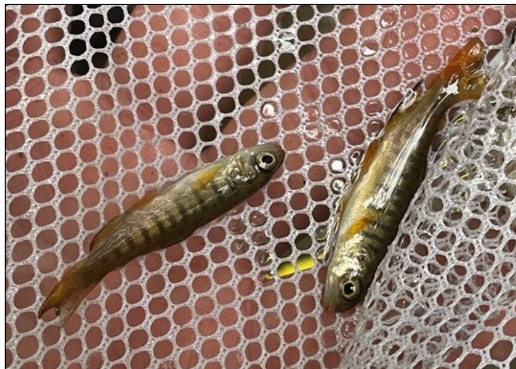
Figure 1.—Juvenile coho salmon captured at waypoint 1231.